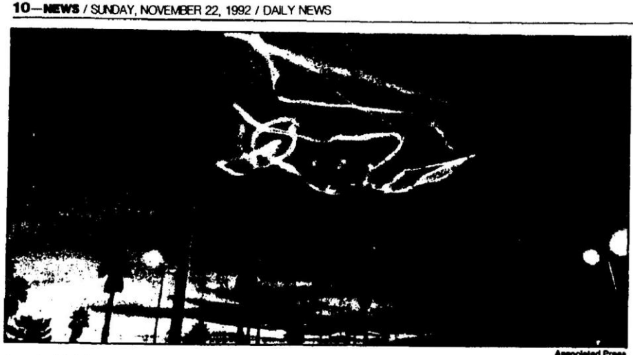
A contrail is left by a rocket, carrying an SDI satellite, that was launched from Vandenberg Air Force Base.