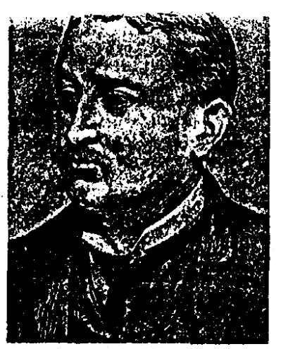
Cecil Rhodes