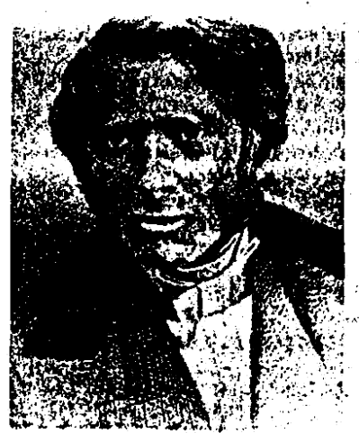
John Ruskin