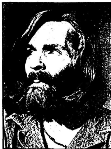
An admitted Red, Satanist cult leader Charles Manson is getting support from the Communists while awaiting trial on seven counts of murder.