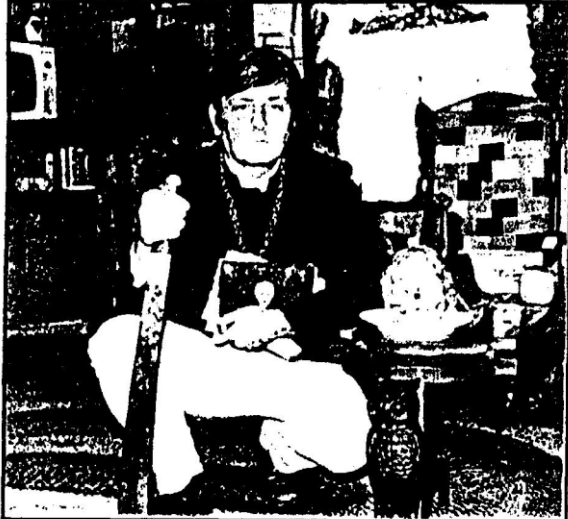
This picture of Satanist Anton LaVey at Black Mass appeared in a 1969 issue of Sundisk , a lewd magazine published by the Leftist Elysium Institute.