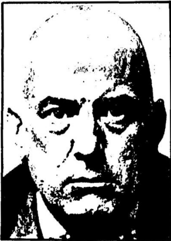
Satanist organizer Aleister Crowley, a sadist and homosexual, corresponded with key Communist Leon Trotsky to whom he offered his services.