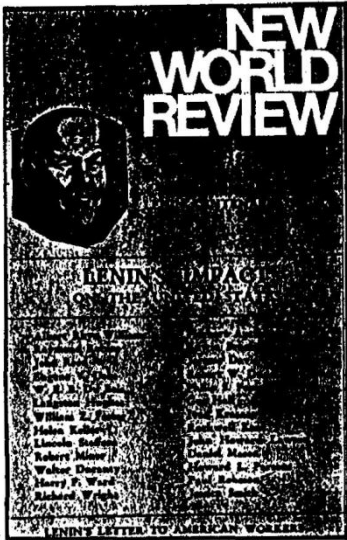
This Communist Party journal helps promote Citadel Press, one of the key suppliers of publications now pushing Satanism and witchcraft.