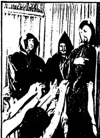
Radical socialist Anton Szandor LaVey, "Black Pope" of the First Church of Satan, now claims over seven thousand members around the world.