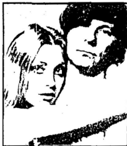
Sharon Tate and her husband, a promoter of Satanism from Poland who still travels on a Red passport.