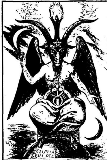
This Satanic horned deity was worshipped by many of the conspiratorial Knights Templar.