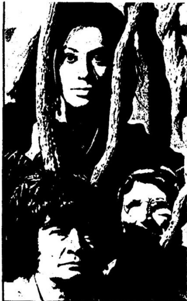
Life magazine glorified Louise Huebner as the youngest of three generations of "good" witches.