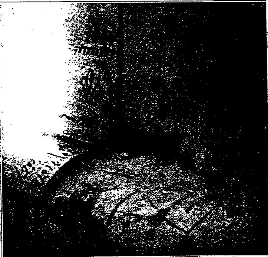
The Cabbalistic Significance of the Mysterious inscription found on the wall of the room in which the Imperial Russian Family was murdered.