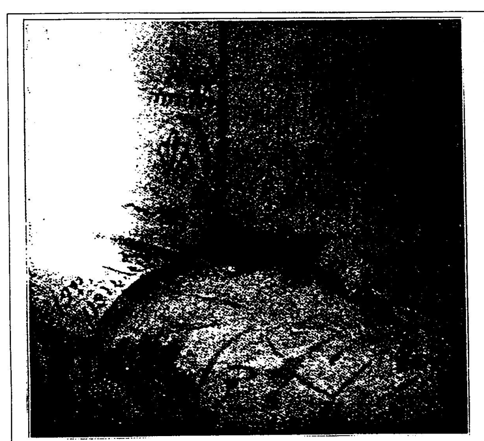
The Cabbalistic Significance of the Mysterious inscription found on the wall of the room in which the Imperial Russian Family was murdered.

The Cabbalistic Significance of the Mysterious inscription found on the wall of the room in which the imperial Russian Family was murdered.